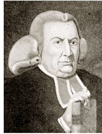
Charles Chauncy (1705-1787)