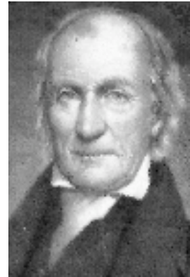
John Leland (1754-1841)