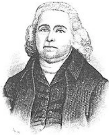
Isaac Backus (1745-1806)